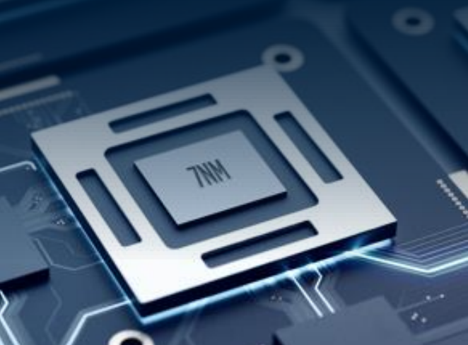
Next Gen Process Node (7nm)