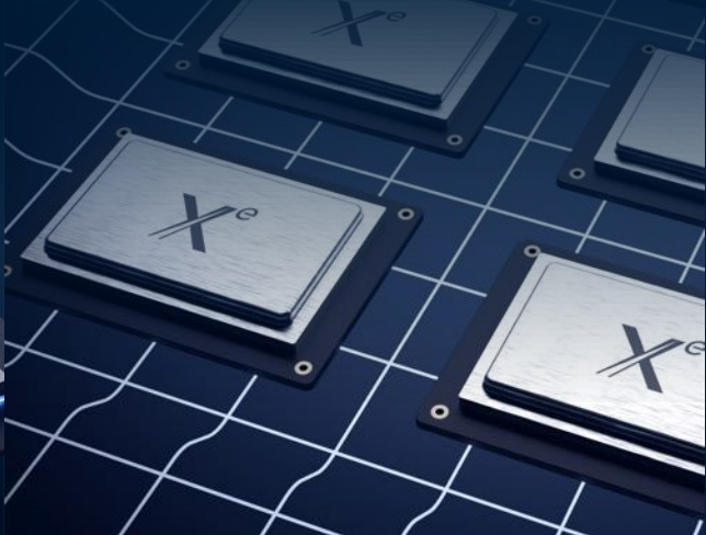
X e Link (CXL Standards Based)